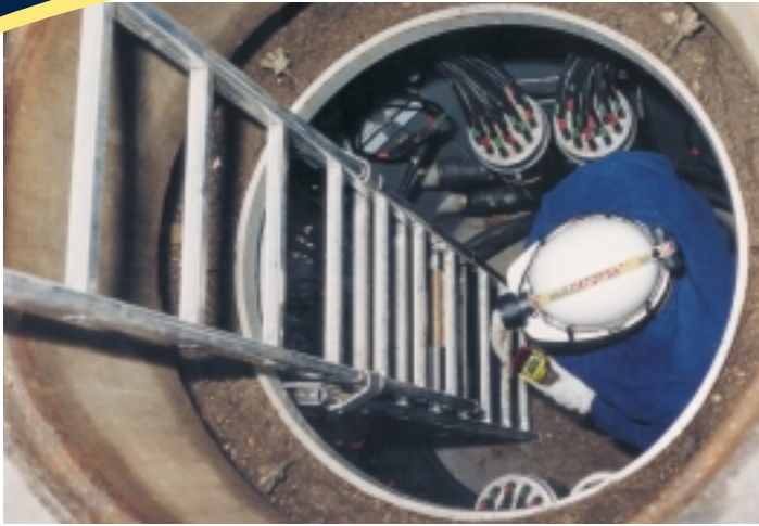
Example of application : operation in confined area