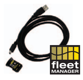
IR Connectivity Kit GA-USB1-IR Use for data download and instrument set-up options