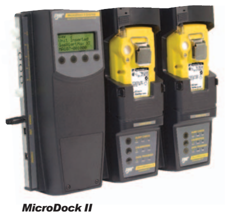
MicroDock II Automatic test and calibration station (see MicroDock II section for additional information)