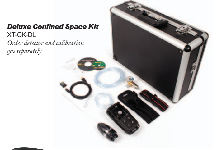
Concussion-Proof Boot GA-BXT